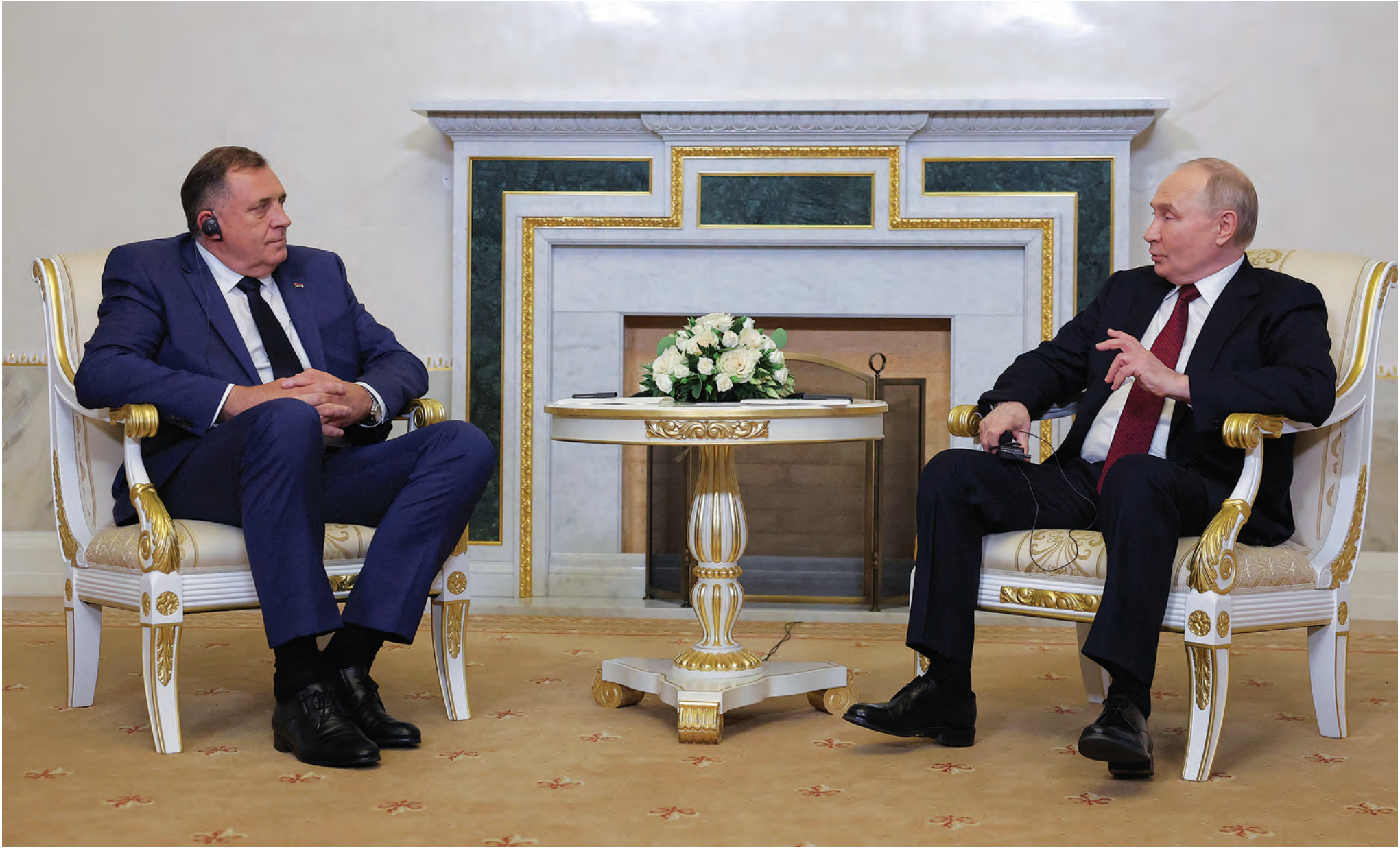
'I HAVE a very good relationship with Putin. Unlike others, I don't hide it.' Russian President Vladimir Putin meets with President of Republika Srpska Milorad Dodik last week.

So what could be expected from Putin? To move his capital beyond the Ural Mountains? Now the West allows Ukraine to use its missiles and planes to attack Russia. I am afraid of an escalation, but hope that peace will prevail. Russia does not want to stay in Ukraine. The people of Crimea decided to be part of Russia, and this should be respected, just as our desire to separate from Bosnia-Herzegovina should be respected.