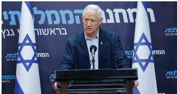
BENNY GANTZ speaking at a faction meeting in March in the Knesset in Jerusalem.

responded to the Likud's statements, saying, "What is unfortunate is that [Prime Minister Benjamin] Netanyahu continues to sit for discussions with-