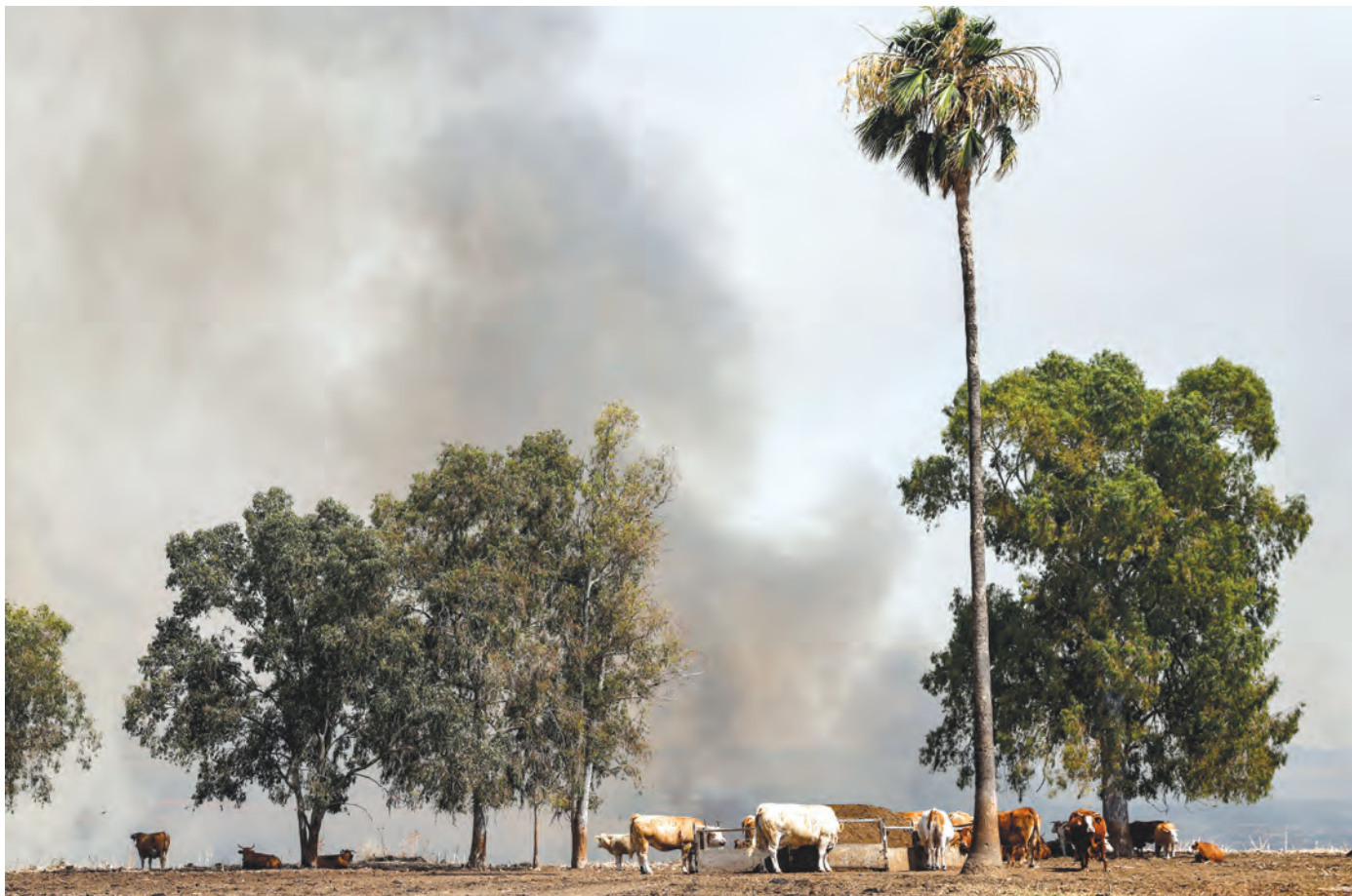
COWS FEED from troughs as plumes of smoke rise behind them in a field that caught fire after a rocket strike originating from southern Lebanon hit landed near Katzrin in the Golan Heights yesterday.

IAF fighter jets struck Hezbollah terrorist infrastructure in the area of Deir Siriane in